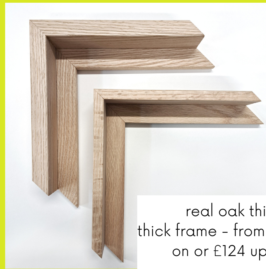
real oak thin or thick frame - from £300 add on or £124 upgrade