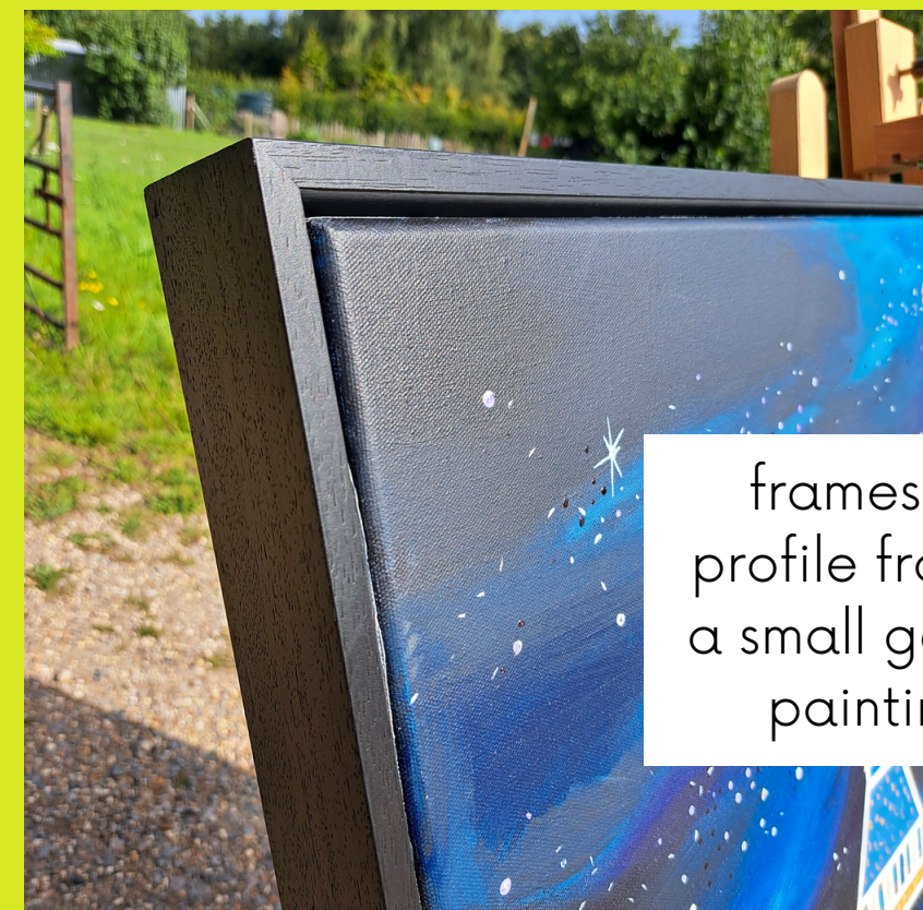
frames have a deep profile from the wall and a small gap between the painting and frame