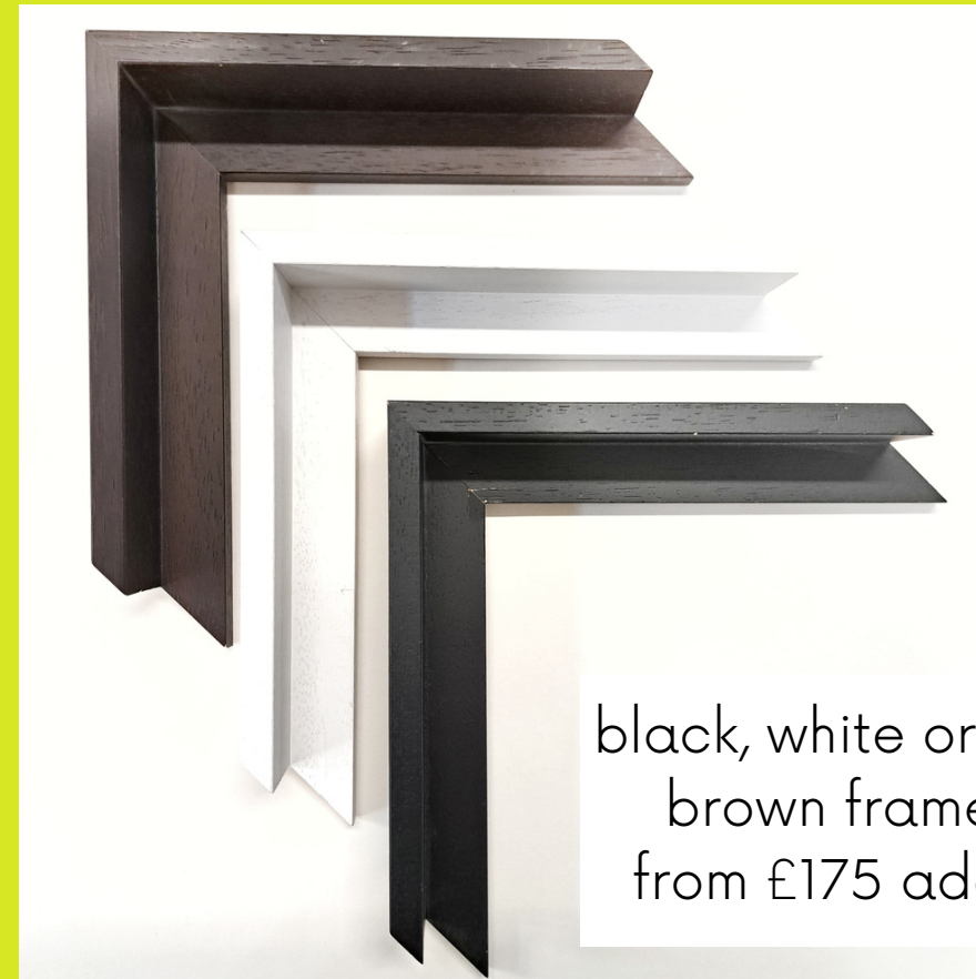
black, white or dark brown frame - from £175 add on

**All frames as extras or upgrades are subject to unique quotes